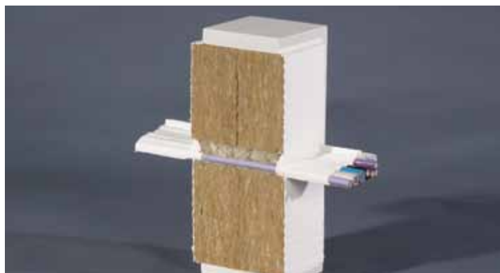
KBS Sealant with mineral wool

KBS Coating and the halogen-free KBS Coating CLF are water resistant ablative coatings. When exposed to fire, an endothermic reaction takes place leading to a cooling effect on the coated surface. Simultaneously, gaseous substances are released which cause a strong flame retardant action thus preventing the spread of the fire. What remains after this reaction is a porous inorganic skeleton which exercises a barrier effect. KBS Coating inhibits reliably and persistently the fire propagation along vertical and horizontal cable routes.