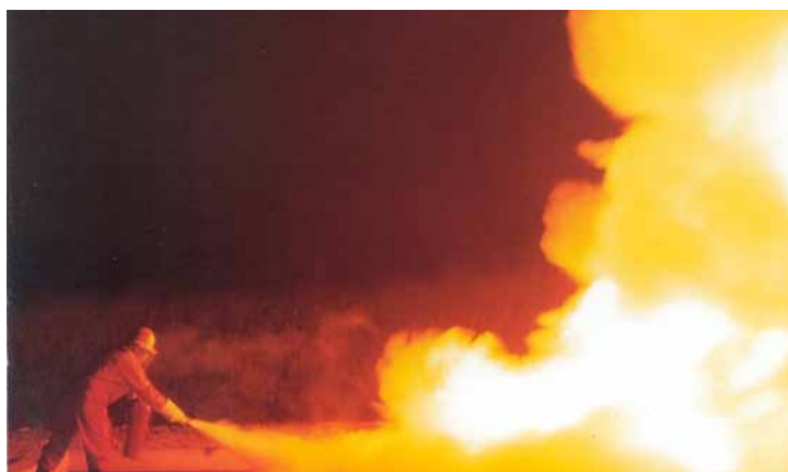
Extinguishing of a liquid fire on our own fire testing area

For more information on BASF Aerospace Materials: aerospace.materials@basf.com www.aerospace.basf.com